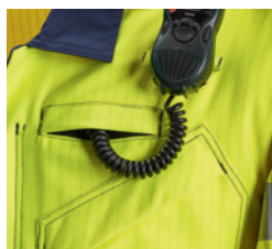
Internal chest pocket for a radio with external opening so mic attaches to radio loop at the shoulder.